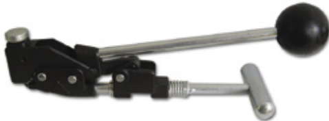
CENTRE PUNCH LOCKING TOOL (NO MALLET) PART NUMBER: PLP-1