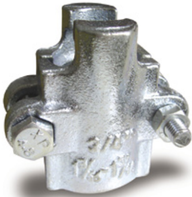
GJCL - 2 BOLT CLAMPS