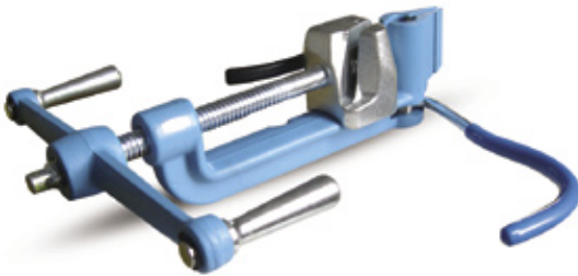
PB-001 BANDING TOOL PART NUMBER: TOOL-001