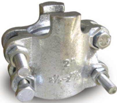
GJCL - 4 BOLT CLAMPS