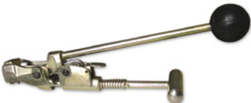
CENTRE PUNCH LOCKING TOOL PART NUMBER: P-1000